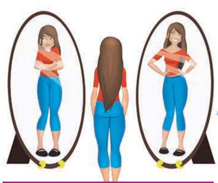
Both guys and girls can have body image issues.

Body image is for the most part, influenced by environmental factors such as the people around you, certain events and experiences and perceived failures or success. There are problems associated with both an overly positive or overly negative body image.