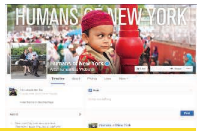
Humans of New York is HUGE! Check it out if you haven't! facebook.com/humansofnewyork

Inspired by the Facebook page 'Humans of New York', our project of 'Humans of Mount Druitt' reflects the voices of the locals who share what they enjoy about living in Mount Druitt. From the vast variety of culture to the strong sense of community and family, our