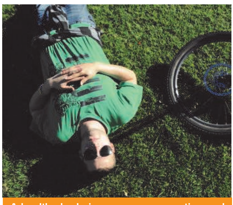
A healthy body image means accepting and liking ourselves for who we are.

A healthy body image leads to a happier life and a more confident outlook within yourself. However, there can be problems associated with positive body image. A common issue seen in the 21st century with the development of social media is a sense of entitlement and higher social standing based solely on physical appearance. Some people use their looks-based popularity to put others down and treat people differently because they don't compare to them in their eyes. This can be problematic for all people involved as it can damage others' self-esteem, and their relationships with other people. A positive view of ourselves should not impact others in a negative way.